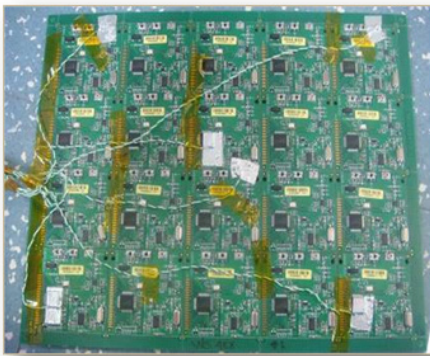
FIGURE 1. The golden board: expensive, but worth it?

Many engineers and technicians I work with rank reflow profiling alongside getting their teeth cleaned or an early morning workout. You know you need to do it, and the benefits are significant, but they aren't immediate, and it is an unpleasant chore. Let's take a minute to go over best practices for reflow profiling. Ideally, a "golden board" will have been supplied as part of the work kit by your customer or your design team. This board (FIGURE 1) will be a sacrificial, fully populated assembly with thermocouples attached (ideally five to seven) with high-temperature solder in strategic locations across the assembly. This board can be processed through the reflow oven to collect detailed information to ensure proper solder reflow temperatures are achieved within the temperature constraints of other components on the assembly.